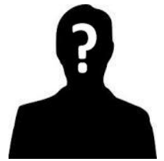
SWEEPER: VOLUNTEERS PLEASE