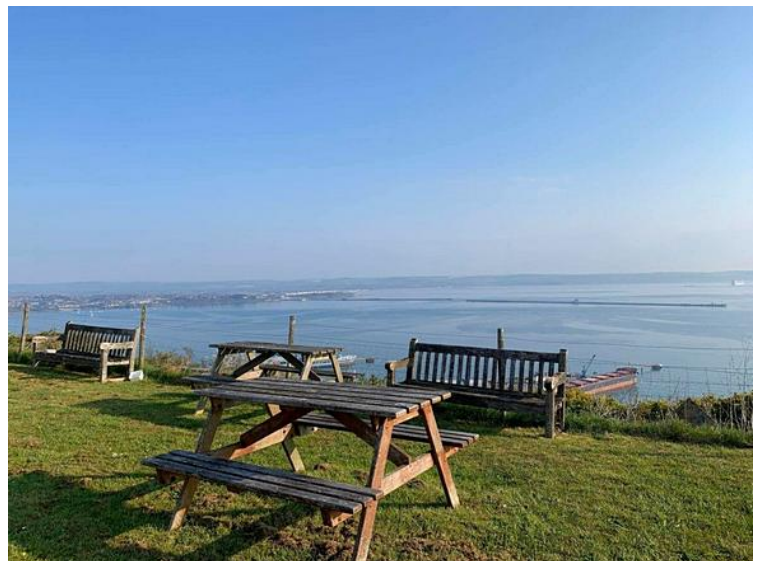
View from the lunch stop - Jailhouse Cafe, Portland

"Devon Advanced Motorcyclists is committed to the improvement of standards of riding by motorcyclists and to the advancement of road safety in Devon."