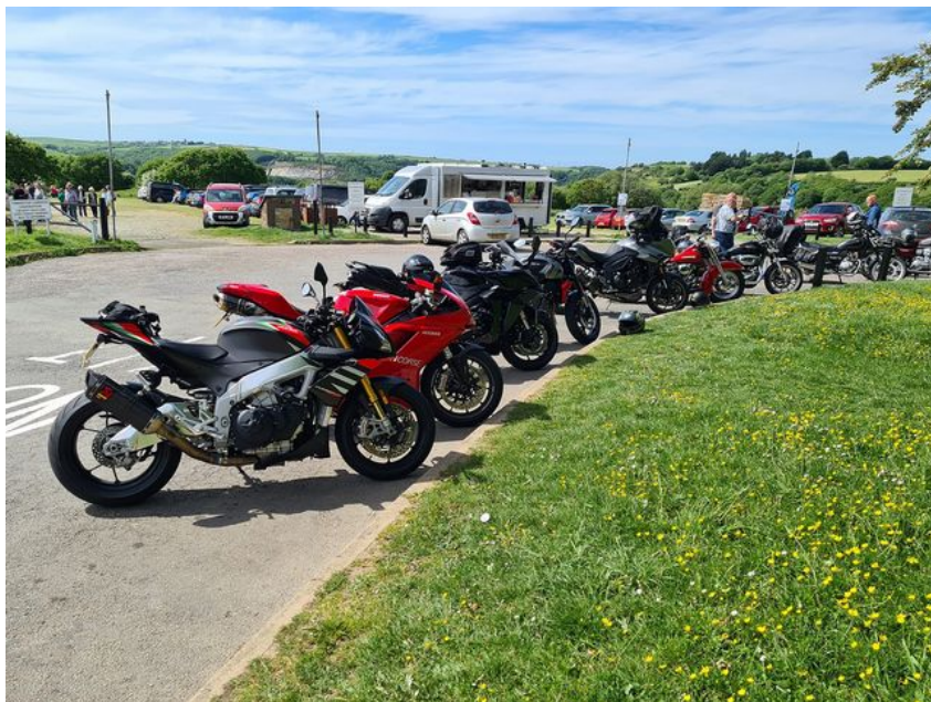
Brunch at Torrington Commons

Winkleigh, 14:00: Finish at Tesco Superstore, Crediton