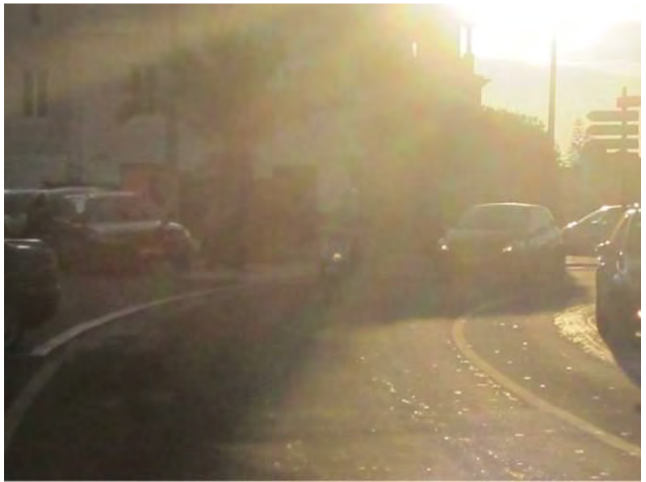
When objects fall into the shadow of 'up-sun' objects they are especially hard to see – did you see the moped coming towards you in the preceding picture, even with its light on?

Keep your windscreen clean! Seeing other vehicles can be difficult enough, without tipping the odds against you by having to look through a dirty windscreen. You <u>never</u> see a fighter jet with a dirty canopy.