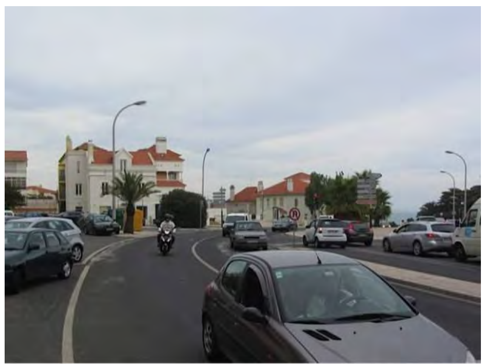
This image is taken on an overcast day – what photographers might call a 'low-contrast day'. However, the vehicles in this scene can all be seen easily, and the light coloured top of the scooter rider provides reasonable contrast against the generally darker background. Note that the headlight is especially effective.