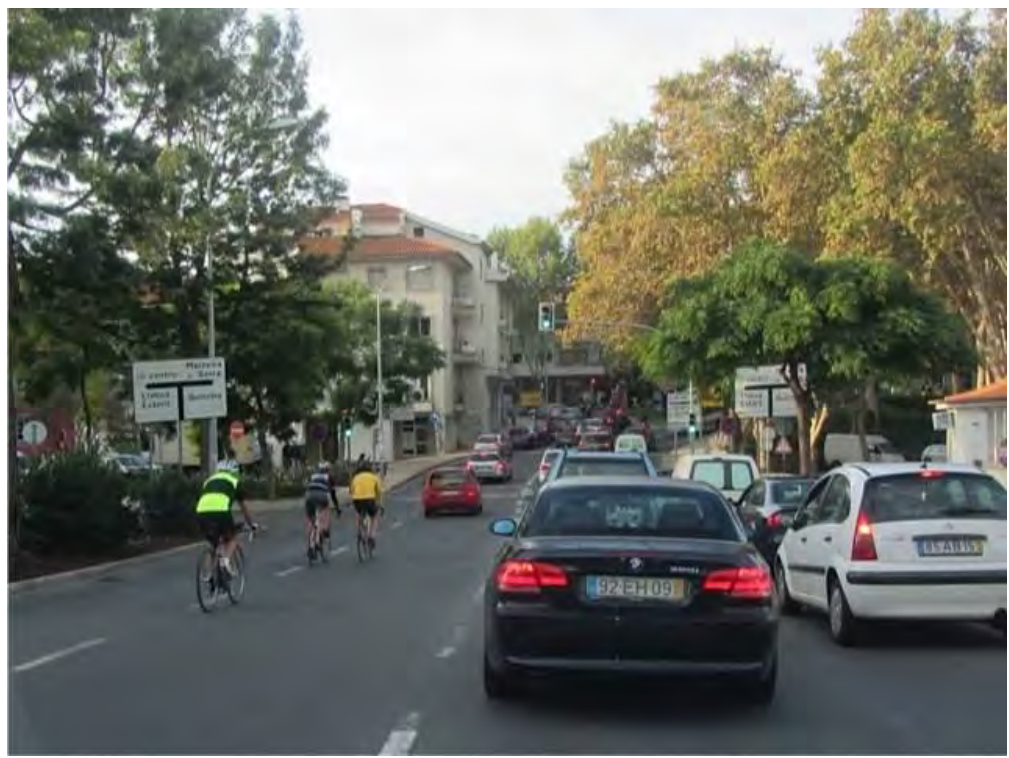
Give yourself a chance! Compare the visibility of the cyclists wearing bright coloured tops, as compared to the cyclist in the centre.