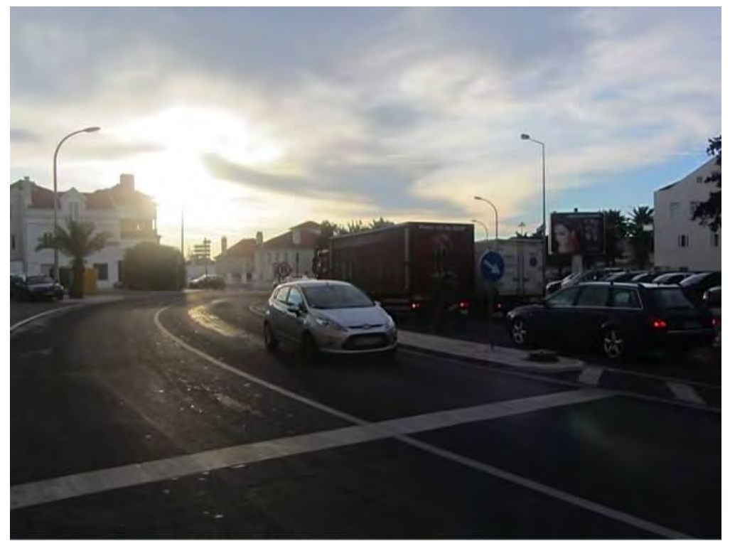
In this scene the sun is partly covered by cloud but contrast is still poor and high visibility clothing, in bright colours that are not generally encountered in the background scene, will increase contrast and be detected more easily.