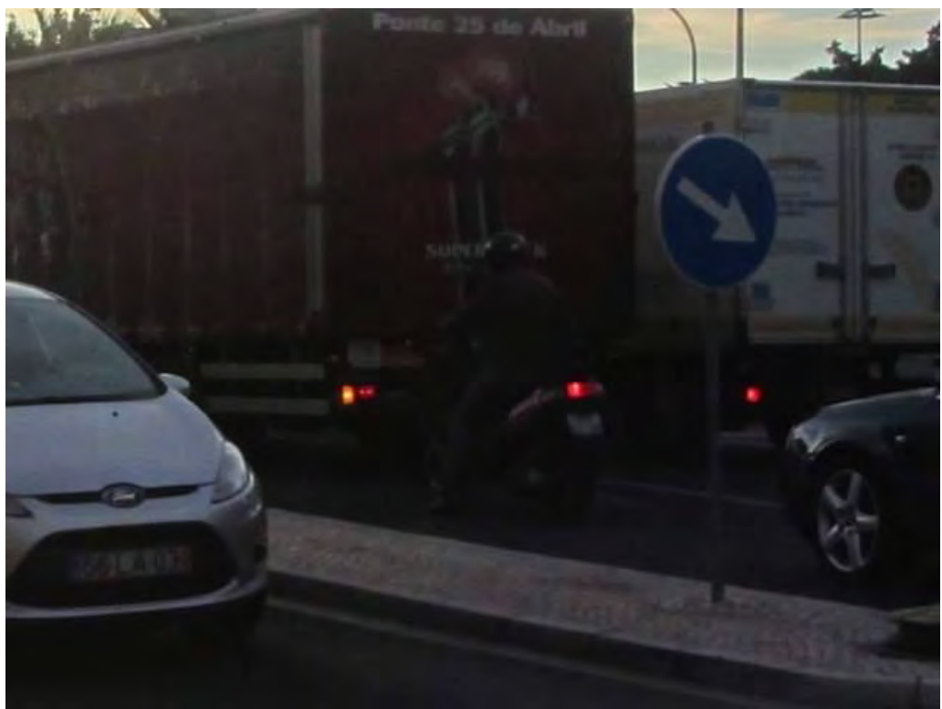
Did you see the moped rider in the preceding picture? Give yourself a chance!

The relatively slower speed of bicycles means that they will be closer to a point of collision if a vehicle begins to pull into their path. Turn this to advantage - when passing junctions, look at the head of the driver that is approaching or has stopped. The head of the driver will naturally stop and centre upon you if you have been seen. If the driver's head sweeps through you without pausing, then the chances are that you are in a saccade - you must assume that you have not been seen and expect the driver to pull out!