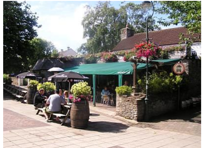
Coffee Stop: Creeks End Inn Kingsbridge

The ride will finish at the Trago2Wheels bike shop, Newton Abbot around 12 noon.