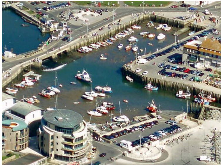
Coffee Stop - Windy Corner Café, West Bay

"Devon Advanced Motorcyclists is committed to the improvement of standards of riding by motorcyclists and to the advancement of road safety in Devon." All Members of the IAM and DAM must accept responsibility for their conduct whilst on the road.