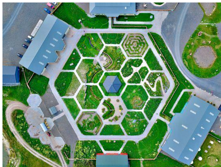
Brunch stop - Quince Honey Farm, South Molton

Early afternoon finish at Cullompton Services, M5 J28.