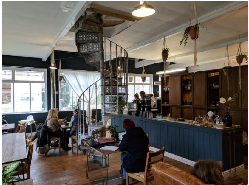
Lunch stop, Brazier Coffee, Wellington