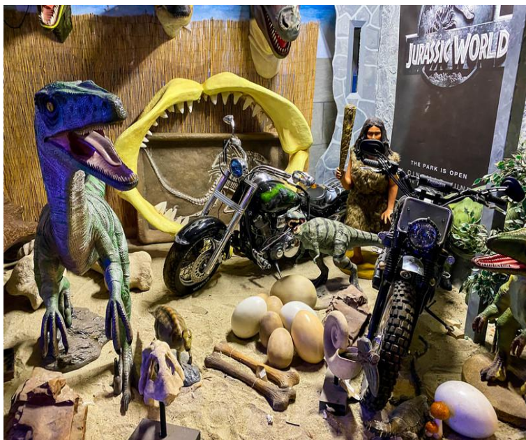
Lunch stop, Jolly Roger, Bovey Tracey

For Full Members or test ready Associates with their Observer