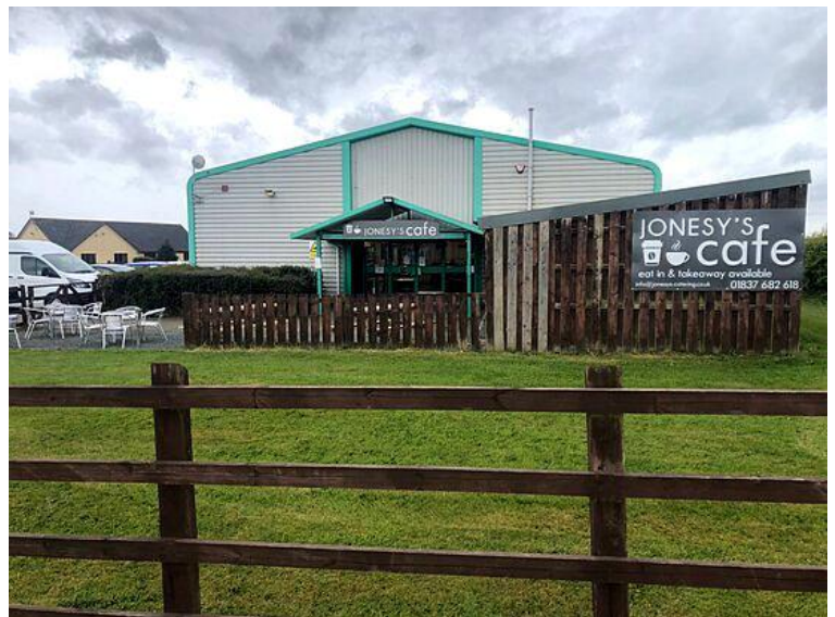
Coffee stop, Jonesy's Cafe, Winkleigh

For Full Members or test ready Associates with their Observer