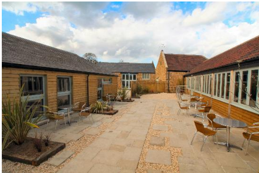
Coffee Stop - Monks Yard Café, Horton Cross, Ilminster