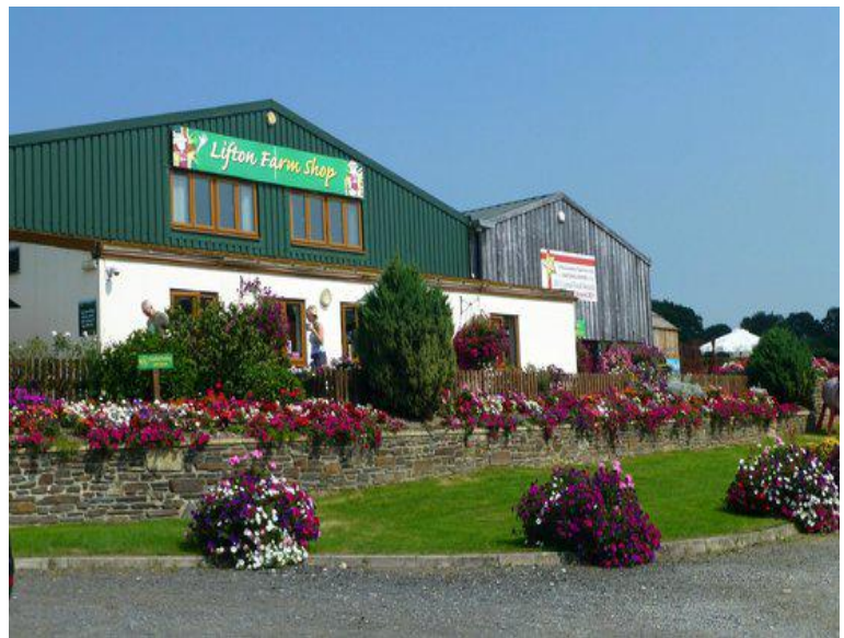
Lunch stop: Strawberry Fields, Lifton Farm Shop

January's Third Thursday ride is an excursion to Polzeath in Cornwall. Meet at Moretonhampstead Court Street car park (off Betton Way at afford.remaining.upon ), 9:30 for 10:00 departure. Across Dartmoor through Tavistock to a leg stretch at Liskeard. Then on to Polzeath (where I haven't booked, but there should be plenty of cafe choices). The return is via Davidstow and Launceston with a stop at Strawberry Fields ( fingernails.kilowatt.plantings ) and ending at about 15:00 at Sourton Down ( waltzes.slimming.polishing ). In all about 110 miles, 3 hours riding plus stops. As usual, for Full Members, a sweeper volunteer needed please. (Associates only if near test ready and accompanied by their Observer.) If you're able, please let me know if attending at lesmosco@hotmail.com or 07799 718283 , or simply see you on the day. Les Mosco piloting, sweeper volunteer(s) please.