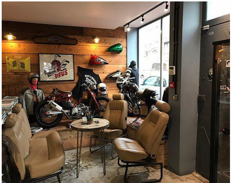
Coffee stop, Union Road Moto-Velo, CREDITON

At the last Rider Development Evening I asked the panel for some favourite rides. February 15th combines 2 of their recommendations, Bovey to Whiddon Down, and CREDITON to Bickleigh. It also has biker places for its start, middle and end! The start will be at Trago Mills 2 wheel centre (fish.doors.procured) 9:30 for 10:00 start so you can look round the bike shop and buy some essentials. Note there's only a simple coffee dispenser in the bike shop, but café (and cheap petrol!) at Trago main shop. Then that first favourite ride, on the A382 twisties through Moretonhampstead to Whiddon Down. Halfway coffee stop is at Union Road Moto Velo in CREDITON (amaze.football.mining) where you can admire their polished Harleys on sale. After that it's the CREDITON-Bickleigh twisties followed by the Exe valley ride to finish for lunch at Café 53 at Bridge Honda (humid.plants.drunk). At 55 miles this is a shorter ride than usual, but packed with biker interest, and I expect to be at Bridge Café 53 about 12:45. Les Mosco piloting, sweeper volunteer(s) please.