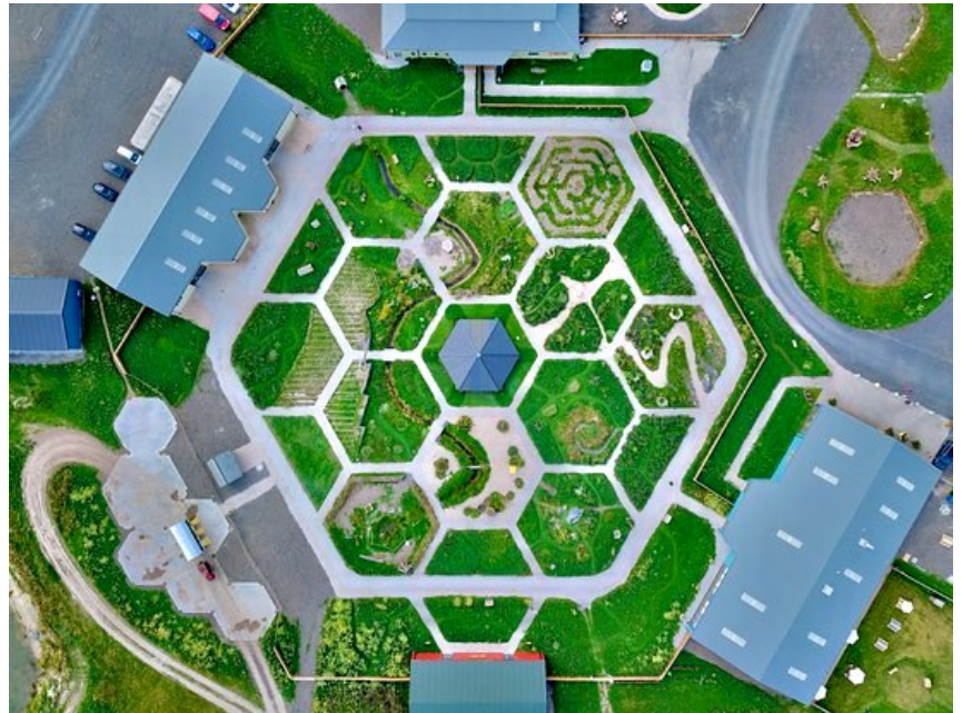
Lunch stop, Quince Honey Farm, South Molton

For Full Members or test ready Associates with their Observer